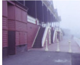
queen elizabeth oval grandstand bendigo front stairs