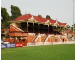
QUEEN ELIZABETH OVAL GRANDSTAND SOHE 2008