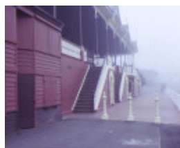
queen elizabeth oval grandstand bendigo front stairs