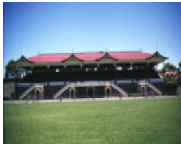
1 queen elizabeth grandstand bendigo front view