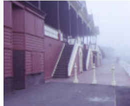
queen elizabeth oval grandstand bendigo front stairs