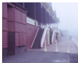
queen elizabeth oval grandstand bendigo front stairs