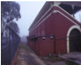
queen elizabeth oval grandstand bendigo rear view