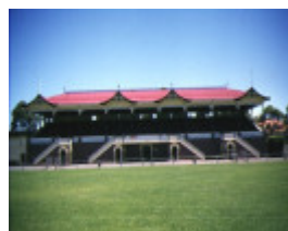
1 queen elizabeth grandstand bendigo front view