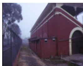
queen elizabeth oval grandstand bendigo rear view