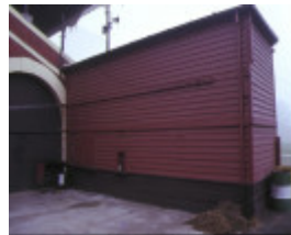
queen elizabeth oval grandstand bendigo entrance