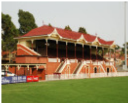
QUEEN ELIZABETH OVAL GRANDSTAND SOHE 2008