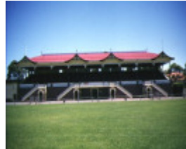
1 queen elizabeth grandstand bendigo front view