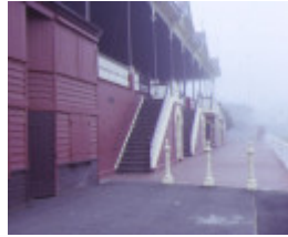
queen elizabeth oval grandstand bendigo front stairs