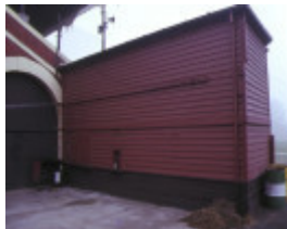
queen elizabeth oval grandstand bendigo entrance