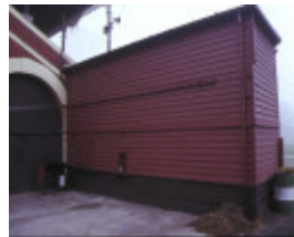
queen elizabeth oval grandstand bendigo entrance