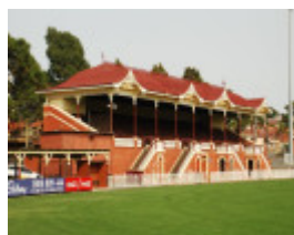
QUEEN ELIZABETH OVAL GRANDSTAND SOHE 2008