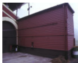
queen elizabeth oval grandstand bendigo entrance