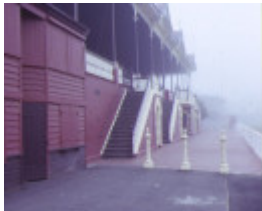
queen elizabeth oval grandstand bendigo front stairs