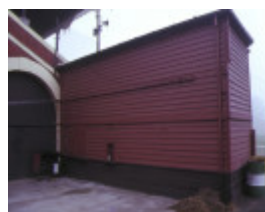
queen elizabeth oval grandstand bendigo entrance