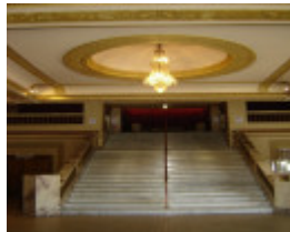
H2092 National theatre st kilda ac nov05 foyer stairs3