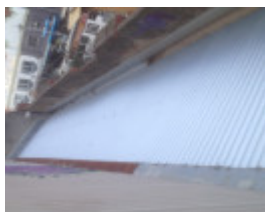
After Photographs - Reference F3880 2016