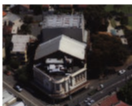
After Photograph - Reference F3880 2016