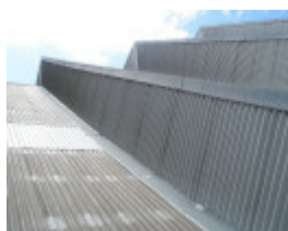
After Photograph - Reference F3880 2016