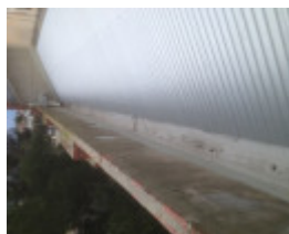
After Photographs - Reference F3880 2016