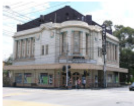
NATIONAL THEATRE SOHE 2008