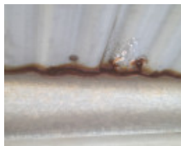
Before Photographs - Reference F3880 2014