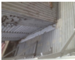
Before Photographs - Reference F3880 2014