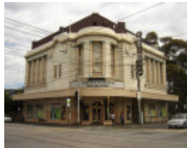
H2092 National theatre st kilda ac nov05 front