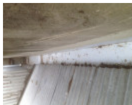
Before Photographs - Reference F3880 2014