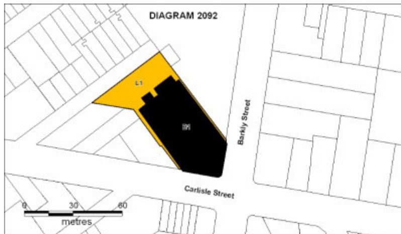
H2092 National theatre st kilda plan