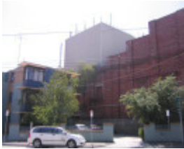
Before Photographs - Reference F3923 2014