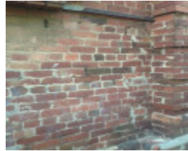
Before Photographs - Reference F3923 2014