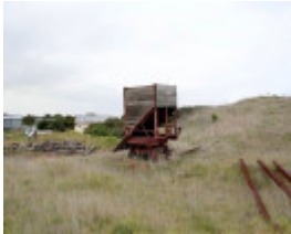
H0198 Wonthaggi State Coal Mine Eastern Precinct H198 July 2007 PM2 lizzie27