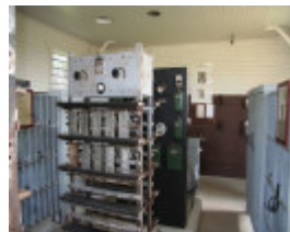
H0198 Wonthaggi State Coal Mine Eastern Precinct H198 July 2007 PM2 lamphouse interior25