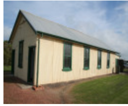
H0198 Wonthaggi State Coal Mine Eastern Precinct H198 July 2007 PM2 lamp house24