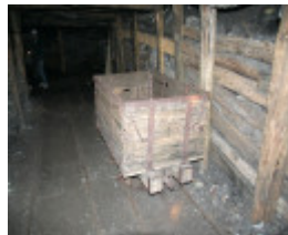
H0198 Wonthaggi State Coal Mine Eastern Precinct H198 July 2007 PM2 trolley55