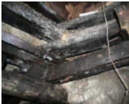
H0198 Wonthaggi State Coal Mine Eastern Precinct H198 July 2007 PM2 crib in roof12