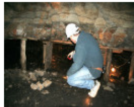
H0198 Wonthaggi State Coal Mine Eastern Precinct H198 July 2007 PM2 thin seam54