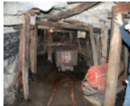
H0198 Wonthaggi State Coal Mine Eastern Precinct H198 July 2007 PM2 fork20