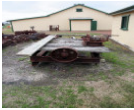
H0198 Wonthaggi State Coal Mine Eastern Precinct H198 July 2007 PM2 sawmill48