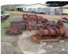
H0198 Wonthaggi State Coal Mine Eastern Precinct H198 July 2007 PM2 rollers46