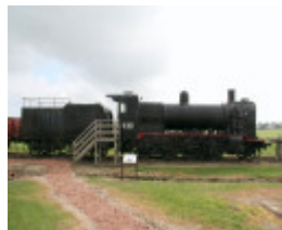
H0198 Wonthaggi State Coal Mine Eastern Precinct H198 July 2007 PM2 loco28