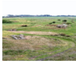
H0198 Wonthaggi State Coal Mine Eastern Precinct H198 July 2007 PM2 winder engine footings 61