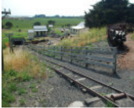
WONTHAGGI STATE COAL MINE (EASTERN PRECINCT) SOHE 2008