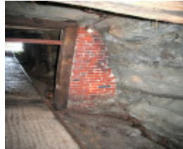
H0198 Wonthaggi State Coal Mine Eastern Precinct H198 July 2007 PM2 air door04