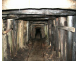
0198 Wonthaggi State Coal Mine Eastern Area Back tunnel incline