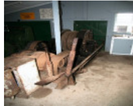
H0198 Wonthaggi State Coal Mine Eastern Precinct H198 July 2007 PM2 SCM underground winch49