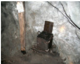
H0198 Wonthaggi State Coal Mine Eastern Precinct H198 July 2007 PM2 dunny16