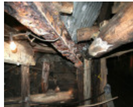
H0198 Wonthaggi State Coal Mine Eastern Precinct H198 July 2007 PM2 steel beam52