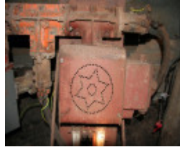
H0198 Wonthaggi State Coal Mine Eastern Precinct H198 July 2007 PM2 drill work14