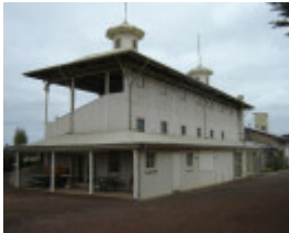
14252 Hamilton racecourse 4Sept06 side rear