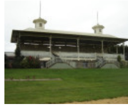
14252 Hamilton racecourse 4Sept06 grandstand7