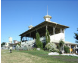
HAMILTON RACECOURSE GRANDSTAND SOHE 2008