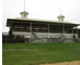
14252 Hamilton racecourse 4Sept06 grandstand7