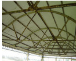
14252 Hamilton racecourse 4Sept06 grandstand roof