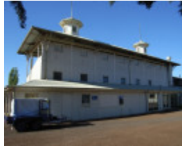
HAMILTON RACECOURSE GRANDSTAND SOHE 2008