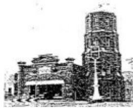
East Ballarat Fire Station - Ballarat Heritage Review, 1998