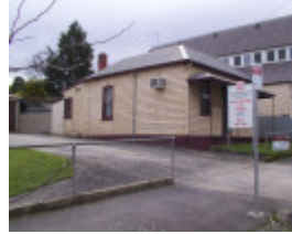
20 Barkly Street