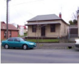
20 Barkly Street