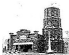
East Ballarat Fire Station - Ballarat Conservation Study, 1978