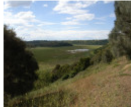
TOWER HILL STATE GAME RESERVE SOHE 2008