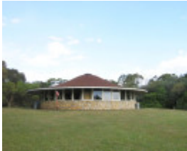
TOWER HILL STATE GAME RESERVE SOHE 2008