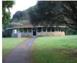
2114 Tower Hill State Game Reserve Interp Centre Jun 06