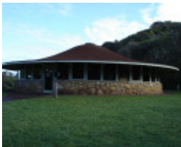
2114 Tower Hill State Game Reserve Interp Centre 2 Jun 06