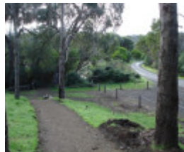
2114 Tower Hill State Game Reserve vegetation jun06