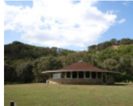
TOWER HILL STATE GAME RESERVE SOHE 2008