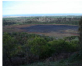
2114 Tower Hill State Game Reserve Jun 06