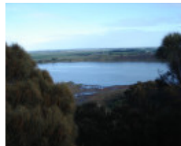
2114 Tower Hill State Game Reserve lake Jun 06