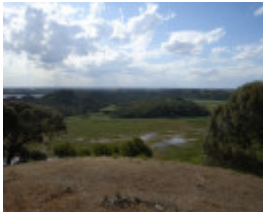
TOWER HILL STATE GAME RESERVE SOHE 2008