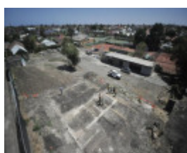
aerial image of site visit 22/1/14