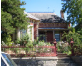
16 Seymour Crescent