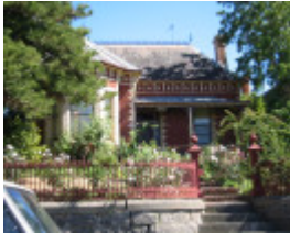
16 Seymour Crescent