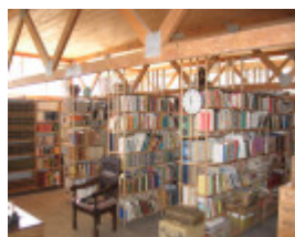
H2118 Baker House Bacchus Marsh Library Interior rc May 2006