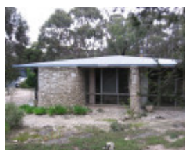
H2118 Baker House Bacchus Marsh Dower House 01 May 2006