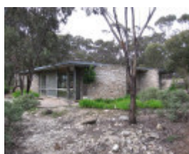
H2118 Baker House Bacchus Marsh Dower House 02 May 2006