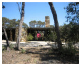
H2118 Baker House Bacchus Marsh Ext Facade Dec 2006 mz