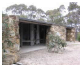
H2118 Baker House Bacchus Marsh west elevation rc May 2006