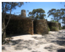
H2118 01 Baker House Bacchus Marsh Dec 2006 mz