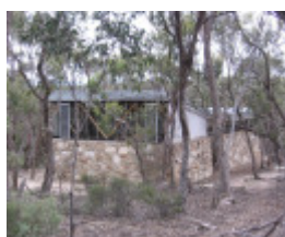
H2118 Baker House Bacchus Marsh Library May 2006