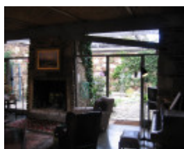
H2118 Baker House Bacchus Marsh Living Room and Courtyard May 2006