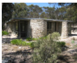
H2118 Baker House Bacchus Marsh Dower House Dec 2006 mz