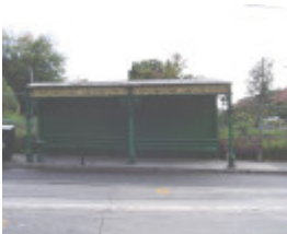
H0173 Tram shelter Kew front