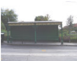
H0173 Tram shelter Kew front