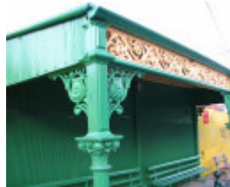
TRAM VERANDAH SHELTER SOHE 2008