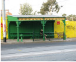
TRAM VERANDAH SHELTER SOHE 2008