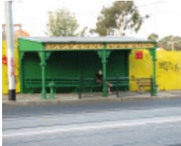
TRAM VERANDAH SHELTER SOHE 2008