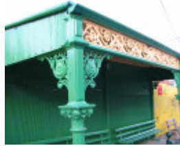
TRAM VERANDAH SHELTER SOHE 2008