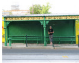
TRAM VERANDAH SHELTER SOHE 2008