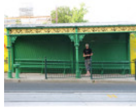
TRAM VERANDAH SHELTER SOHE 2008