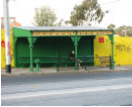
TRAM VERANDAH SHELTER SOHE 2008