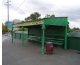
H0175 Tram shelter Toorak Station Armadale 03