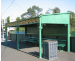
TRAM VERANDAH SHELTER SOHE 2008