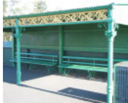
TRAM VERANDAH SHELTER SOHE 2008