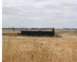
HERRNHUT UTOPIAN COMMUNE SOHE 2008