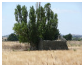
HERRNHUT UTOPIAN COMMUNE SOHE 2008