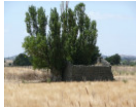
HERRNHUT UTOPIAN COMMUNE SOHE 2008