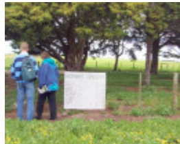
H2107 Herrnhut H2107 cemetery April 2006