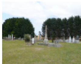
HERRNHUT UTOPIAN COMMUNE SOHE 2008