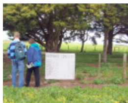
H2107 Herrnhut H2107 cemetery April 2006