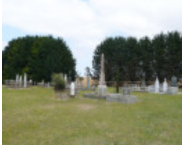
HERRNHUT UTOPIAN COMMUNE SOHE 2008