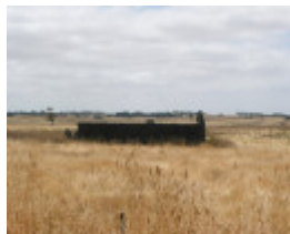
HERRNHUT UTOPIAN COMMUNE SOHE 2008