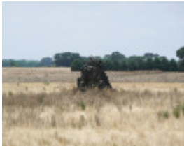
HERRNHUT UTOPIAN COMMUNE SOHE 2008