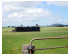
H2107 Herrnhut H2107 general view April 2006