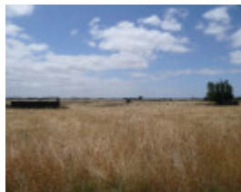
HERRNHUT UTOPIAN COMMUNE SOHE 2008