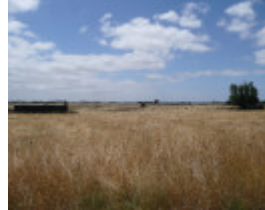
HERRNHUT UTOPIAN COMMUNE SOHE 2008