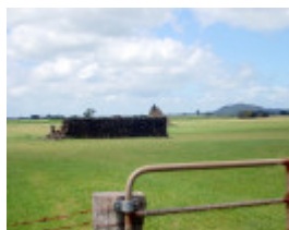
H2107 Herrnhut H2107 general view April 2006