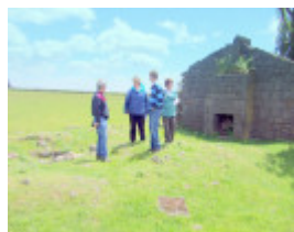
H2107 Herrnhut H2107 Krummnows house ruin April 2006