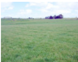
H2107 Herrnhut H2107 ridge and furrows April 2006