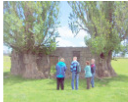
H2107 Herrnhut H2107 Krummnows house ruin b April 2006