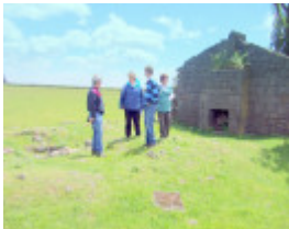
H2107 Herrnhut H2107 Krummnows house ruin April 2006