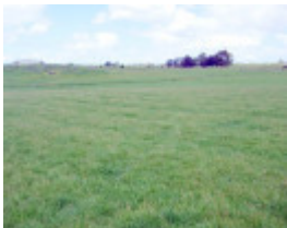
H2107 Herrnhut H2107 ridge and furrows April 2006