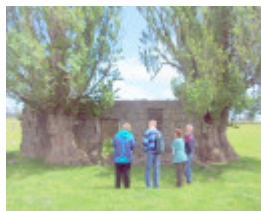
H2107 Herrnhut H2107 Krummnows house ruin b April 2006