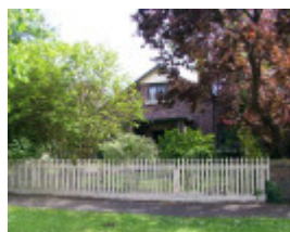
1514 Sturt Street