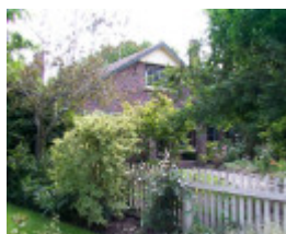
1514 Sturt Street