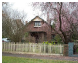
1514 Sturt Street