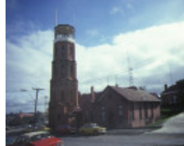
1 ballarat fire station front view aug1985