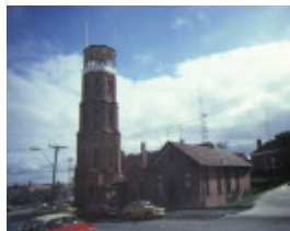
1 ballarat fire station front view aug1985