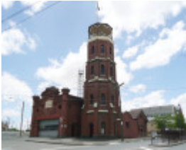
BALLARAT FIRE STATION SOHE 2008