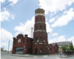
BALLARAT FIRE STATION SOHE 2008