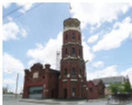
BALLARAT FIRE STATION SOHE 2008