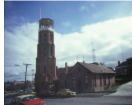
1 ballarat fire station front view aug1985