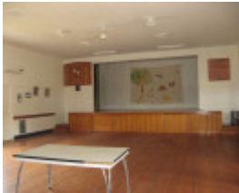
Woodhouse-Nareeb Soldiers Memorial Hall