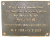
Woodhouse-Nareeb Soldiers Memorial Hall