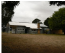
WOODHOUSE-NAREEB SOLDIERS MEMORIAL HALL 14442 P1050870