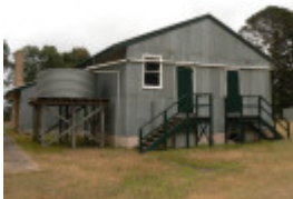
WOODHOUSE-NAREEB SOLDIERS MEMORIAL HALL 14442 P1050873