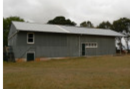
WOODHOUSE-NAREEB SOLDIERS MEMORIAL HALL 14442 P1050875