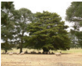
WOODHOUSE-NAREEB SOLDIERS MEMORIAL HALL 14442 P1050876