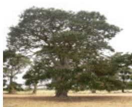
WOODHOUSE-NAREEB SOLDIERS MEMORIAL HALL tree 14442 P1050877