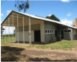
Woodhouse-Nareeb Soldiers Memorial Hall