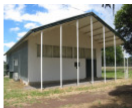
Woodhouse-Nareeb Soldiers Memorial Hall