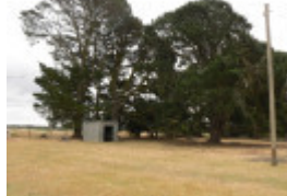
WOODHOUSE-NAREEB SOLDIERS MEMORIAL HALL 14442 P1050874