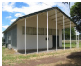
Woodhouse-Nareeb Soldiers Memorial Hall