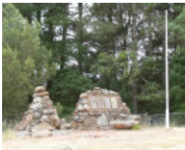
Memorial BUNDORAN LANE and CNR HAMILTON CHATSWORTH ROAD GLENTHOMPSON, 14442 P1050864