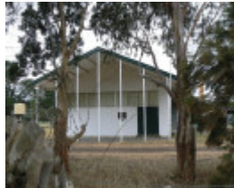
WOODHOUSE-NAREEB SOLDIERS MEMORIAL HALL 14442 P1050865