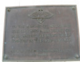
Woodhouse-Nareeb Soldiers Memorial Hall