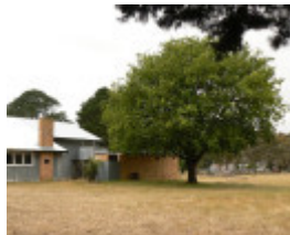
WOODHOUSE-NAREEB SOLDIERS MEMORIAL HALL 14442 P1050869