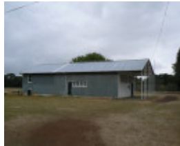
WOODHOUSE-NAREEB SOLDIERS MEMORIAL HALL COMPLEX 14442 P1050866