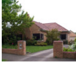
1519 Sturt Street