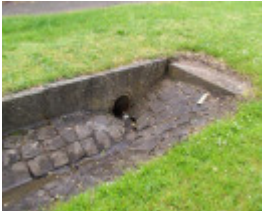
1519 Sturt Street