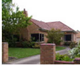
1519 Sturt Street