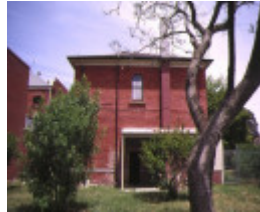
dudley house bendigo rear view nov1998