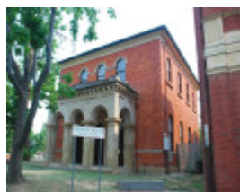
DUDLEY HOUSE SOHE 2008