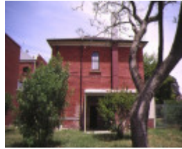
dudley house bendigo rear view nov1998