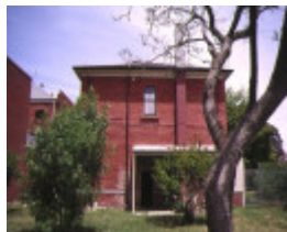
dudley house bendigo rear view nov1998