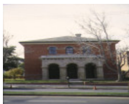
1 dudley house bendigo front elevation 1998