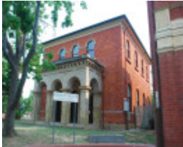
DUDLEY HOUSE SOHE 2008