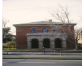
1 dudley house bendigo front elevation 1998