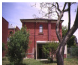
dudley house bendigo rear view nov1998