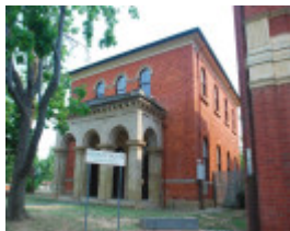
DUDLEY HOUSE SOHE 2008