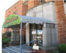
Horsham Town Hall 2 March 2011 KJ