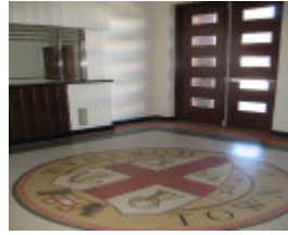
Horsham Town Hall 2 March 2011 KJ