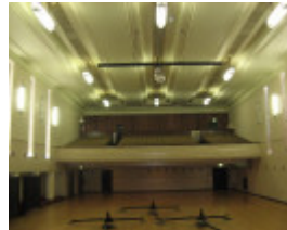
Horsham Town Hall 2 March 2011 KJ