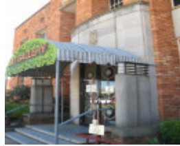
Horsham Town Hall 2 March 2011 KJ