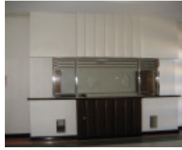
Horsham Town Hall 2 March 2011 KJ