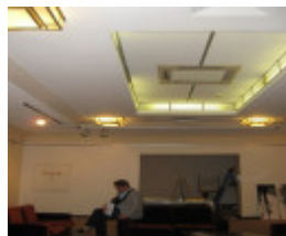
Horsham Town Hall 2 March 2011 KJ