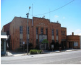
Horsham Town Hall 2 March 2011 KJ