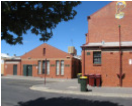
Horsham Town Hall 2 March 2011 KJ