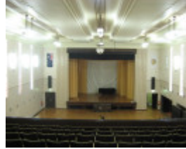
Horsham Town Hall 2 March 2011 KJ