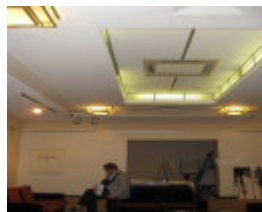
Horsham Town Hall 2 March 2011 KJ