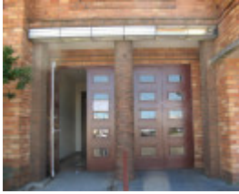
Horsham Town Hall 2 March 2011 KJ