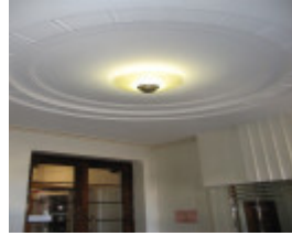
2011_mar_2_Horsham Town Hall (27).jpg