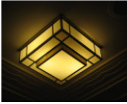
Horsham Town Hall 2 March 2011 KJ