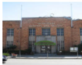
Horsham Town Hall 2 March 2011 KJ