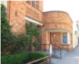
Horsham Town Hall 2 March 2011 KJ