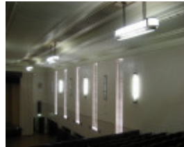
Horsham Town Hall 2 March 2011 KJ