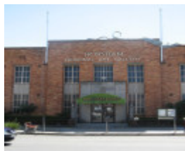
Horsham Town Hall 2 March 2011 KJ