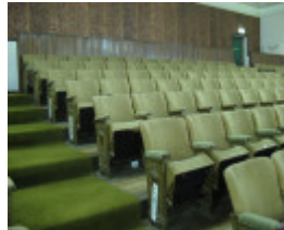
Horsham Town Hall 2 March 2011 KJ