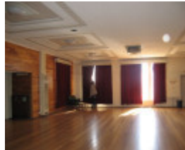
Horsham Town Hall 2 March 2011 KJ