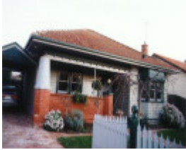
Ellison St 08