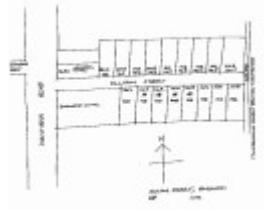
Ellison St 08