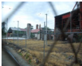
FORMER BENDIGO GAS WORKS SOHE 2008