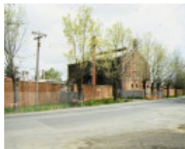
1 former bendigo gas works bendigo rear view oct1992