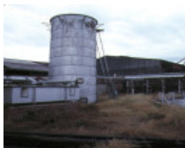
former bendigo gas works bendigo silo mar1989