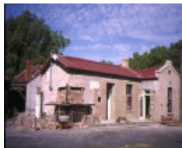
former bendigo gas works bendigo residence office