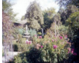
h01168 yarrowee hall darling street ballarat front garden she project 2003