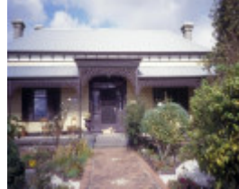
h01168 1 yarrowee hall darling street ballarat facade of house she project 2003