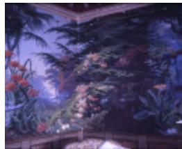
h01168 yarrowee hall darling street ballarat wallpaper detail she project 2003