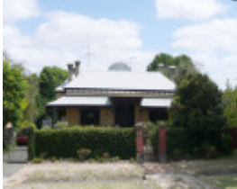
YARROWEE HALL SOHE 2008