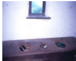
h01168 yarrowee hall darling street ballarat three seater outhouse she project 2003