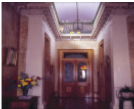
h01168 yarrowee hall darling street ballarat grand hall atrium above she project 2003