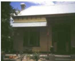
h01168 yarrowee hall darling street ballarat front elevation