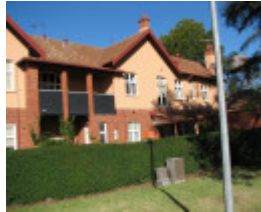
EDRINGTON SOHE 2008