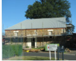
EDRINGTON SOHE 2008