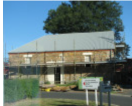
EDRINGTON SOHE 2008