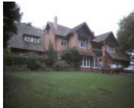
1 edrington berwick front view of house apr1985