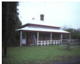
edrington berwick former homestead brick cottage