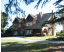
EDRINGTON SOHE 2008