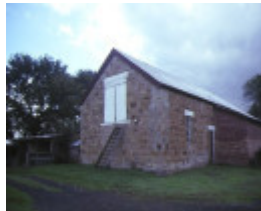
edrington berwick barn apr1985