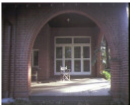
edrington berwick brick arch of house apr1985