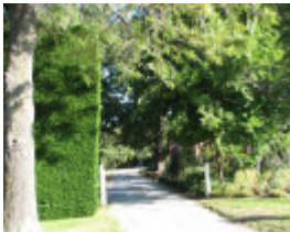
EDRINGTON SOHE 2008