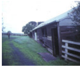
edrington berwick outbuildings apr1985