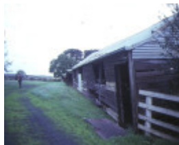
edrington berwick outbuildings apr1985