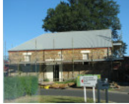
EDRINGTON SOHE 2008