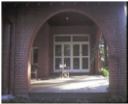
edrington berwick brick arch of house apr1985