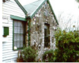
H01982 old curiosity shop nov 2001