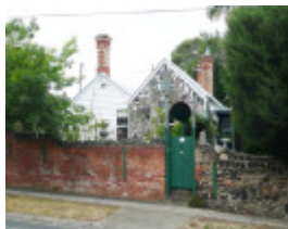
OLD CURIOSITY SHOP SOHE 2008