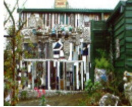
H01982 old curiosity shop exterior nov 2001