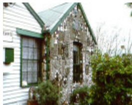
H01982 old curiosity shop nov 2001