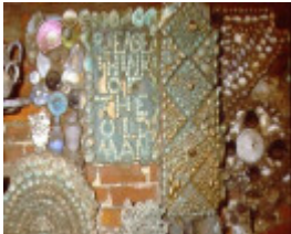
H01982 old curiosity shop think of the old man nov 2001