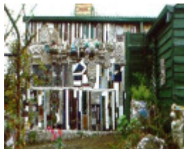
H01982 old curiosity shop exterior nov 2001