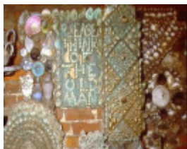
H01982 old curiosity shop think of the old man nov 2001