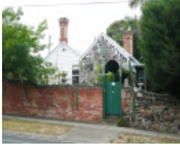
OLD CURIOSITY SHOP SOHE 2008