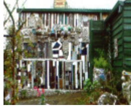
H01982 old curiosity shop exterior nov 2001