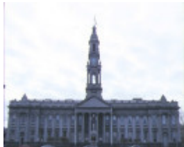
1 town hall bank street south melb front view