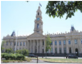
SOUTH MELBOURNE TOWN HALL SOHE 2008