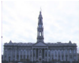
1 town hall bank street south melb front view