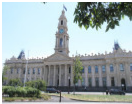
SOUTH MELBOURNE TOWN HALL SOHE 2008