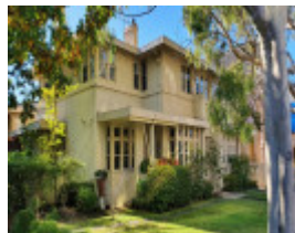
579 Toorak Road, TOORAK