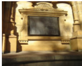
plaque2 boer war memorial stkilda rd2 nov06 jb