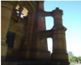
boer war memorial buttress Nov06 jb