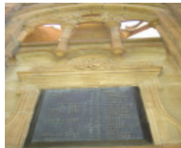
plaque3 boer war memorial stkilda rd jb