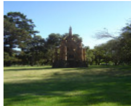
boer war memorial full view nov 06 jb