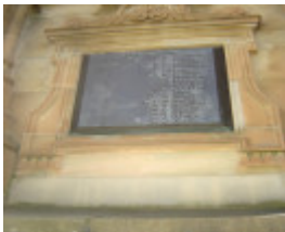
plaque1 boer war memorial st kilda rd nov06 jb