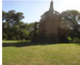
boer war memorial nov06 jb