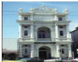
1 former colonial bank bendigo front view dec1993