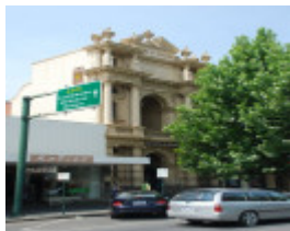
NATIONAL AUSTRALIA BANK SOHE 2008