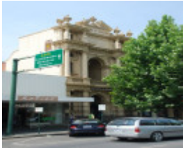
NATIONAL AUSTRALIA BANK SOHE 2008