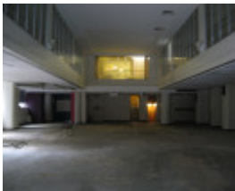
Former Commonwealth Bank Bourke St_Oct 2010