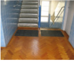
2010_Oct_1_Commonwealth Bank_Melb_site_visit_kj (50).jpg