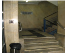
Former Commonwealth Bank Bourke St_Oct 2010