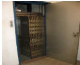
Former Commonwealth Bank Bourke St_Oct 2010