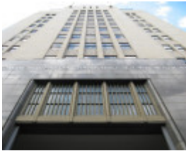
Former Commonwealth Bank Bourke St_Oct 2010