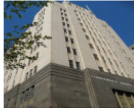
Former Commonwealth Bank Bourke St_Oct 2010