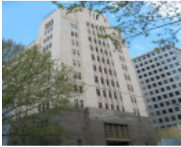
Former Commonwealth Bank Bourke St_Oct 2010