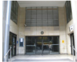
Former Commonwealth Bank Bourke St_Oct 2010