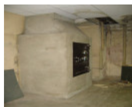
Former Commonwealth Bank Bourke St_Oct 2010