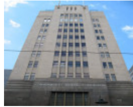
Former Commonwealth Bank Bourke St_Oct 2010