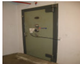
Former Commonwealth Bank Bourke St_Oct 2010