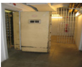
Former Commonwealth Bank Bourke St_Oct 2010