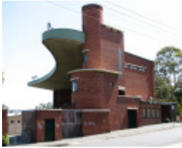
GLENFERRIE OVAL GRANDSTAND SOHE 2008