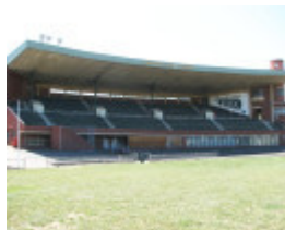
GLENFERRIE OVAL GRANDSTAND SOHE 2008