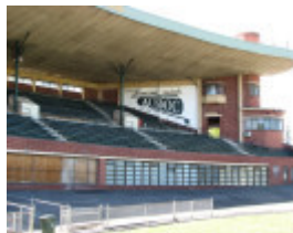
GLENFERRIE OVAL GRANDSTAND SOHE 2008