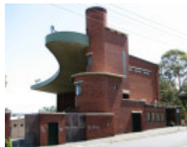
GLENFERRIE OVAL GRANDSTAND SOHE 2008