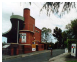
1 glenferrie oval grandstand linda crescent hawthorn side view