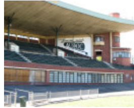
GLENFERRIE OVAL GRANDSTAND SOHE 2008