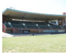
GLENFERRIE OVAL GRANDSTAND SOHE 2008