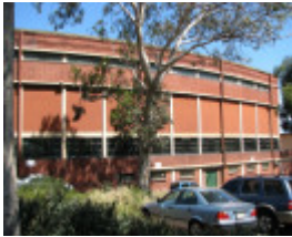
GLENFERRIE OVAL GRANDSTAND SOHE 2008