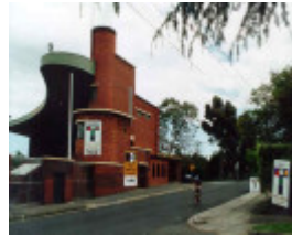
1 glenferrie oval grandstand linda crescent hawthorn side view