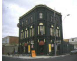
1 golden age hotel geelong front view apr1997