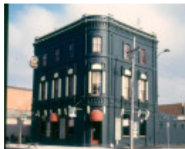
Golden Age Hotel Geelong Front