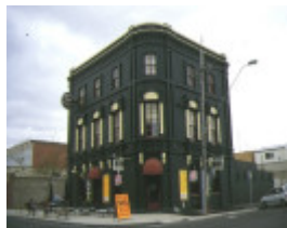
1 golden age hotel geelong front view apr1997