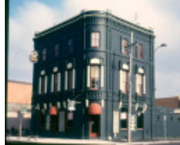
Golden Age Hotel Geelong Front