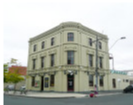
GOLDEN AGE HOTEL SOHE 2008