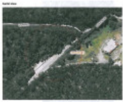
Former Crossroad Station