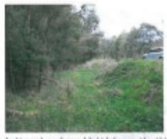
Looking north-east along track bed (platforms to either side)