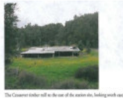
The Crossover timber mill to the east of the station site, looking north-east.