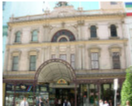
ROYAL ARCADE SOHE 2008