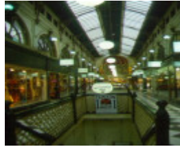
1 royal arcade melbourne interior sw oct1999