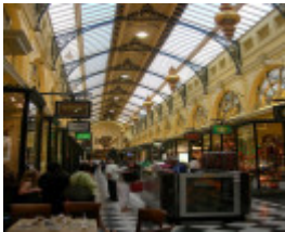
ROYAL ARCADE SOHE 2008