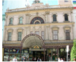
ROYAL ARCADE SOHE 2008