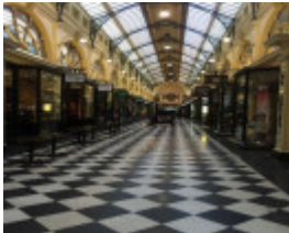
ROYAL ARCADE July 2016