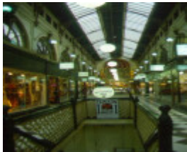
1 royal arcade melbourne interior sw oct1999