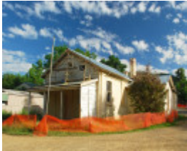
BRIGHT COURT HOUSE AND LOCK-UP SOHE 2008