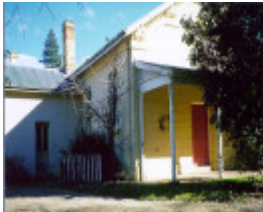
Bright Courthouse Front