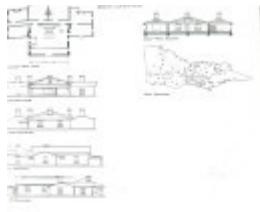
Bright court house architectural plans