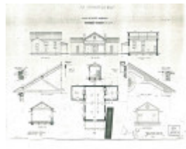
Bright court house architectural plan