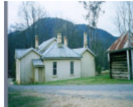
bright courthouse lockup