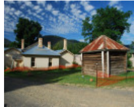
BRIGHT COURT HOUSE AND LOCK-UP SOHE 2008