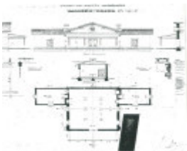
Bright court house architectural plan