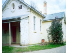
1 bright courthouse