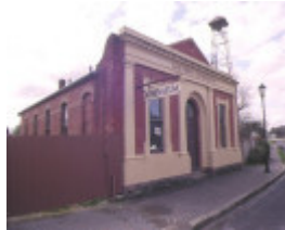
1 athenaeum library & town hall conness street chiltern front view