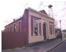
1 athenaeum library & town hall conness street chiltern front view