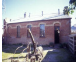
chiltern anthenaeum and museum conness st chiltern east elevation 2003