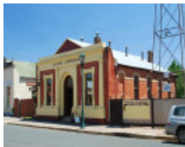
CHILTERN ATHENAEUM AND MUSEUM SOHE 2008