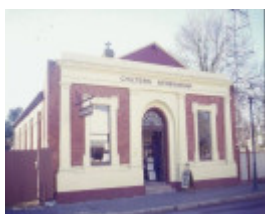
chiltern anthenaeum and museum conness st chiltern front from south west she project 2003