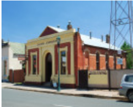
CHILTERN ATHENAEUM AND MUSEUM SOHE 2008