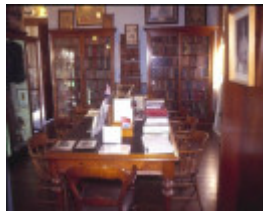
chiltern anthenaeum and museum conness st chiltern interior 2003