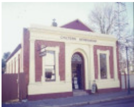
chiltern anthenaeum and museum conness st chiltern front from south west she project 2003