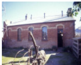
chiltern anthenaeum and museum conness st chiltern east elevation 2003