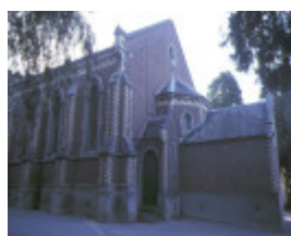
former congregational church brighton rear of church nov1984