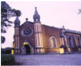
1 former congregational church brighton front view