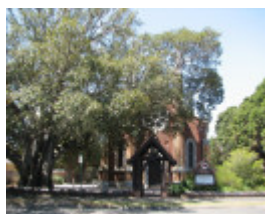
FORMER CONGREGATIONAL CHURCH SOHE 2008