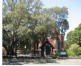
FORMER CONGREGATIONAL CHURCH SOHE 2008