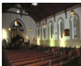
former congregational church brighton interior fron view