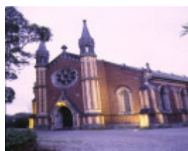
1 former congregational church brighton front view