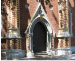
FORMER CONGREGATIONAL CHURCH SOHE 2008