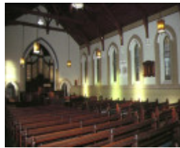
former congregational church brighton interior fron view