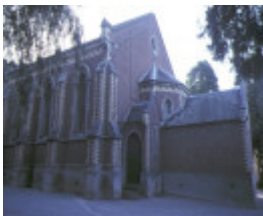
former congregational church brighton rear of church nov1984