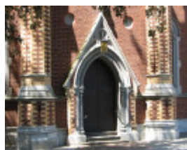
FORMER CONGREGATIONAL CHURCH SOHE 2008