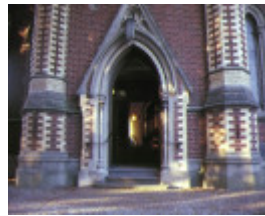
former congregational church brighton detail of front entrance