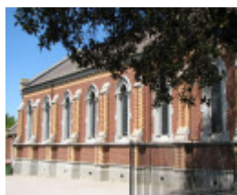
FORMER CONGREGATIONAL CHURCH SOHE 2008