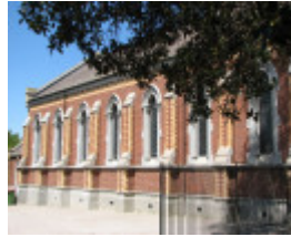
FORMER CONGREGATIONAL CHURCH SOHE 2008