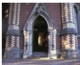
former congregational church brighton detail of front entrance