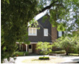
SPURLING HOUSE SOHE 2008