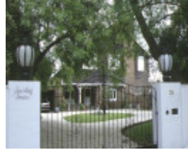
spurling house black street brighton front gates sept1999