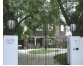
spurling house black street brighton front gates sept1999