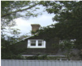
spurling house black street brighton side view sept1999