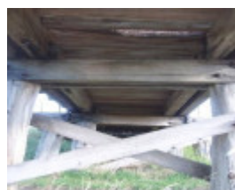
1604 Dennington Railway Bridge3