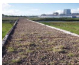
1604 Dennington Railway Bridge4