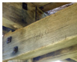
RAILWAY BRIDGE SOHE 2008