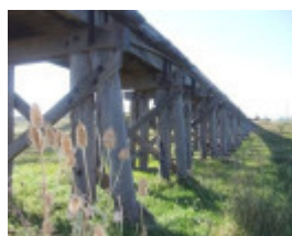
1604 Dennington Railway Bridge2