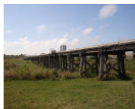
RAILWAY BRIDGE SOHE 2008