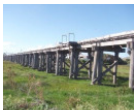
1604 Dennington Railway Bridge