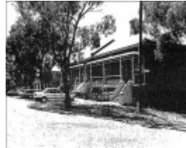
Fernville Terrace, 35-41 Mackenzie Street, 1885-; demonstrating the influence of the steep terrain on house design in this part of Bendigo where sub-basements become full height on the downhill side of a site.