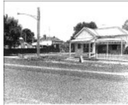
Precinct 6.04 - corner of Milroy and Stevenson, precinct 6.4: corner store and adjacent timber houses of the late 19th early 20th centuries.