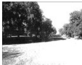
The leafy path of Barkly Street, as it crosses Barkly Terrace