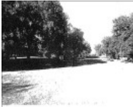
The leafy path of Barkly Street, as it crosses Barkly Terrace