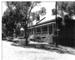
Fernville Terrace, 35-41 Mackenzie Street, 1885-; demonstrating the influence of the steep terrain on house design in this part of Bendigo where sub-basements become full height on the downhill side of a site.