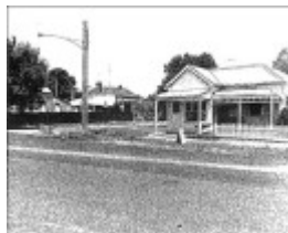
Precinct 6.04 - corner of Milroy and Stevenson, precinct 6.4: corner store and adjacent timber houses of the late 19th early 20th centuries.