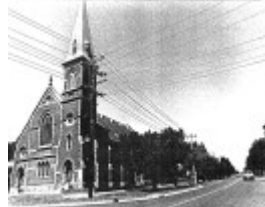
Former Golden Square Precinct 10 - Panton Street Church.jpg