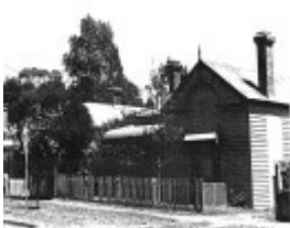
Former Golden Square Precinct 10 - House at 28 Panton Street.jpg