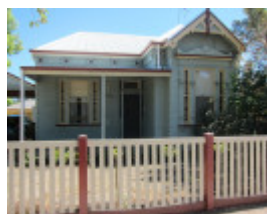
247 Napier Street