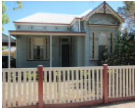
247 Napier Street