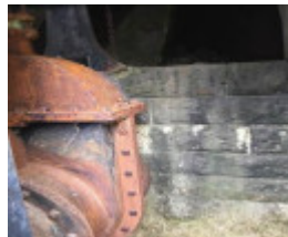
The water supply outlet valve in the eastern house.jpg