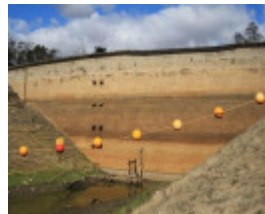
The inner face of the Lower Stony Creek Dam Wall showing some water in the reservoir.jpg