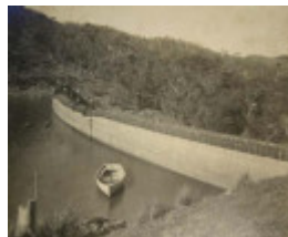
The inner face of the Lower Stony Creek Dam Wall c.1910.gif