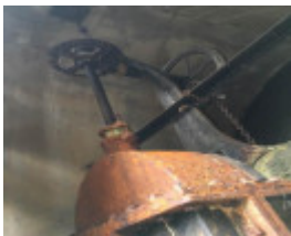
The water supply outlet valve in the eastern house(2).jpg