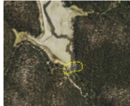
Aerial photo of the location of the Lower Stony Creek Dam Wall