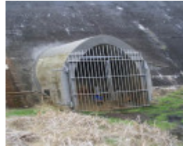
The western valve house.jpg