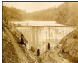
The outer face of the dam wall during construction 1873.gif