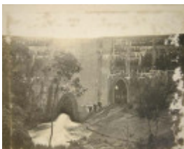
The outer face of the Lower Stony Creek Dam Wall c.1910