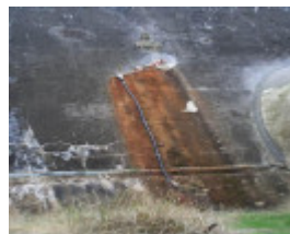
Crack in the dam wall.jpg