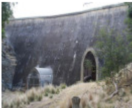
The Valve Houses (The left one is the West Valve House).jpg