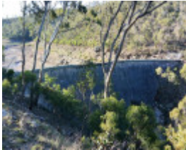
Lower Stony Creek Dam Wall.jpg