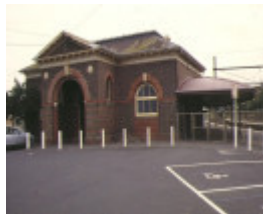
brighton beach railway station front entrance jan1995