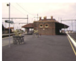
brighton beach railway station central platform jan1995