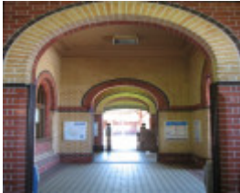
BRIGHTON BEACH RAILWAY STATION SOHE 2008