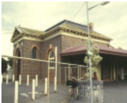
brighton beach railway station side view