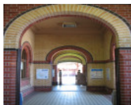
BRIGHTON BEACH RAILWAY STATION SOHE 2008