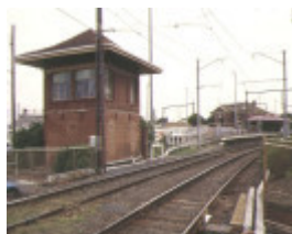
brighton beach railway station signal box