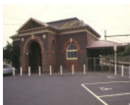
brighton beach railway station front entrance jan1995