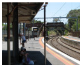
BRIGHTON BEACH RAILWAY STATION SOHE 2008