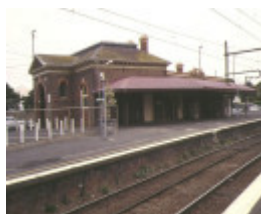
1 brighton beach railway station platform jan1995