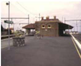
brighton beach railway station central platform jan1995