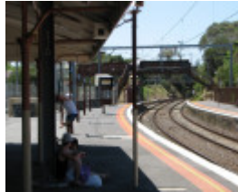
BRIGHTON BEACH RAILWAY STATION SOHE 2008