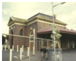
brighton beach railway station side view