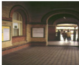
brighton beach railway station interior tiled floor