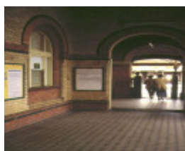
brighton beach railway station interior tiled floor