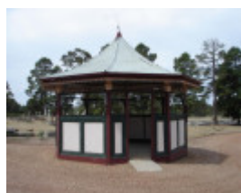
H2136 White Hills Cemetery 9 Feb 200 mz 048