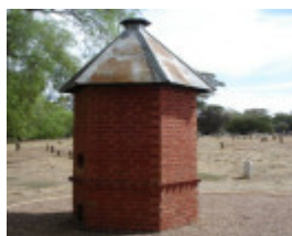
H2136 White Hills Cemetery 9 Feb 200 mz 022