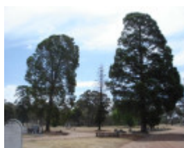
H2136 White Hills Cemetery 9 Feb 200 mz 041