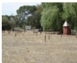
H2136 White Hills Cemetery 9 Feb 200 mz 025