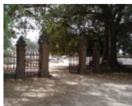
H2136 White Hills Cemetery 9 Feb 200 mz 001