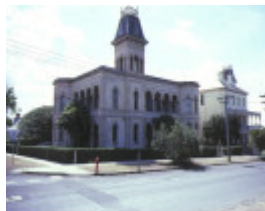
1 lathamstowe gellibrand street queenscliff front view