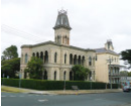
LATHAMSTOWE SOHE 2008