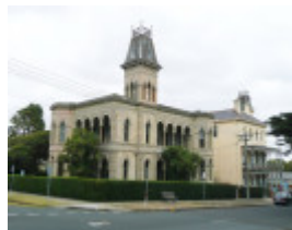
LATHAMSTOWE SOHE 2008