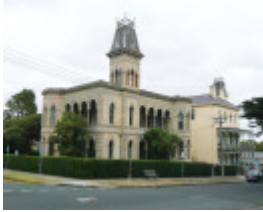
LATHAMSTOWE SOHE 2008