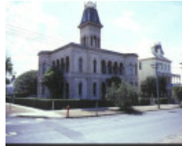
1 lathamstowe gellibrand street queenscliff front view