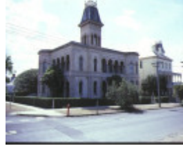
1 lathamstowe gellibrand street queenscliff front view