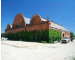
FAIRFIELD SOHE 2008