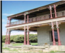
fairfield murray hwy browns plains verandah of homestead sep1990