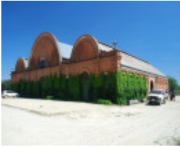
FAIRFIELD SOHE 2008