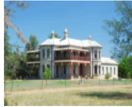
FAIRFIELD SOHE 2008