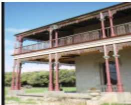
fairfield murray hwy browns plains verandah of homestead sep1990