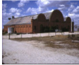
1 fairfield murray hwy browns plains wine cellars dec1987