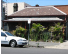
COTTAGE SOHE 2008