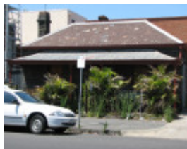
COTTAGE SOHE 2008