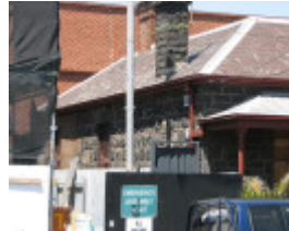
COTTAGE SOHE 2008