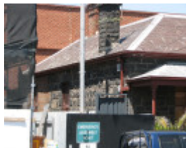
COTTAGE SOHE 2008