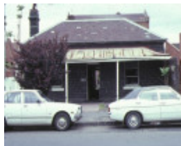
1 cottage barkly street brunswick front view oct1984