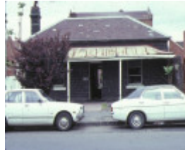
1 cottage barkly street brunswick front view oct1984