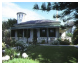
1 roseville cottage mercer street queenscliff front view