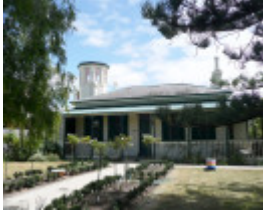
ROSEVILLE COTTAGE SOHE 2008