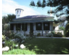
1 roseville cottage mercer street queenscliff front view