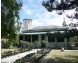
ROSEVILLE COTTAGE SOHE 2008