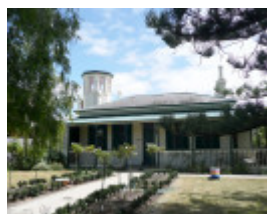
ROSEVILLE COTTAGE SOHE 2008