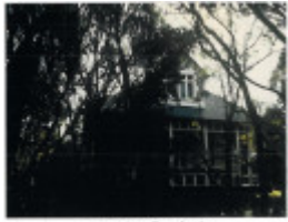
Arilpa - Front elevation