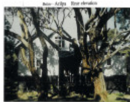
Arilpa - Side elevation