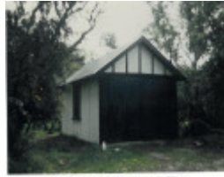
Arilpa - Original pigpen outbuilding