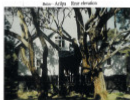
Arilpa - Side elevation