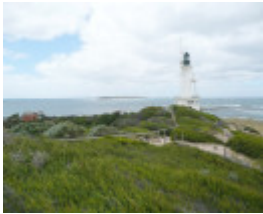
POINT LONSDALE LIGHTHOUSE SOHE 2008