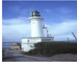
1 point lonsdale lighthouse point lonsdale front view aug1984