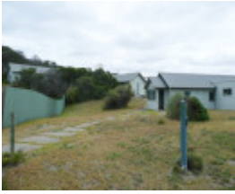
POINT LONSDALE LIGHTHOUSE SOHE 2008