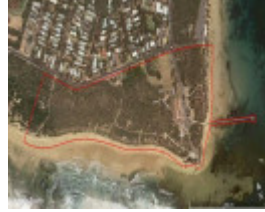
aerial view extent of registration.jpg