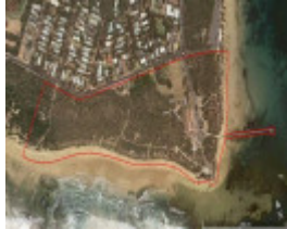
aerial view extent of registration.jpg