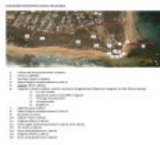
buildings and features.JPG