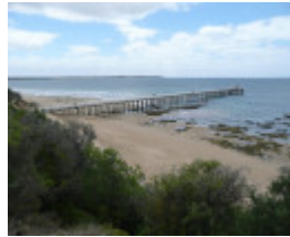
POINT LONSDALE LIGHTHOUSE SOHE 2008