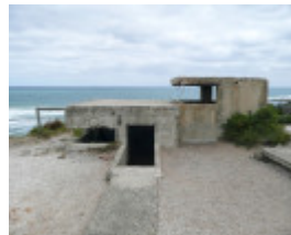
POINT LONSDALE LIGHTHOUSE SOHE 2008