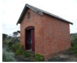
POINT LONSDALE LIGHTHOUSE SOHE 2008