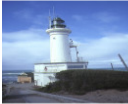
1 point lonsdale lighthouse point lonsdale front view aug1984