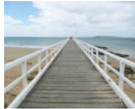
POINT LONSDALE LIGHTHOUSE SOHE 2008