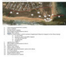
buildings and features.JPG