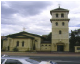
christ church brunswick tower