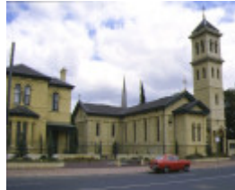
Christ Church Brunswick Front View