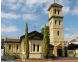
CHRIST CHURCH SOHE 2008