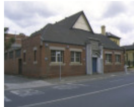
Christ Church Brunswick Rear View