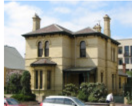
CHRIST CHURCH SOHE 2008